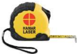
TAPE MEASURE SPONSOR