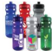
SPORTS BOTTLE SPONSOR