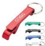
BOTTLE OPENER SPONSOR