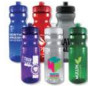
SPORTS BOTTLE SPONSOR