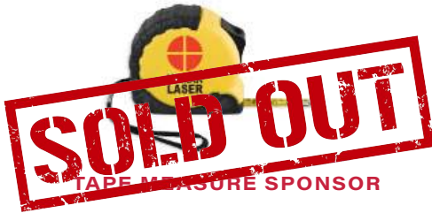
TAPE MEASURE SPONSOR