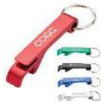
BOTTLE OPENER SPONSOR