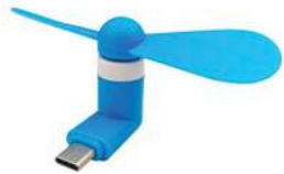
PHONE FAN SPONSOR